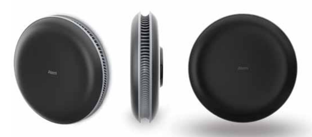
The Atem Car's functional and elegant design complements any car interior.

The Atem's elegant design embraces the circle as a functional element. With an electronically commutated impeller at its center, the air purifier's disk-shaped design allows for an exceptionally large air intake and a huge filter surface area for an air purifier of its size. This means maximum airflow for best air cleaning results and long filter life.